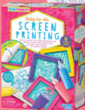
KidzMaker Screen Printing 404797

INCLUDES A 50X50CM BANDANA FOR 1ST PRINT PROJECTS