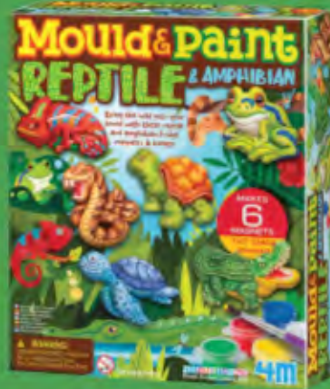
Mould & Paint Reptile & Amphibian 404798