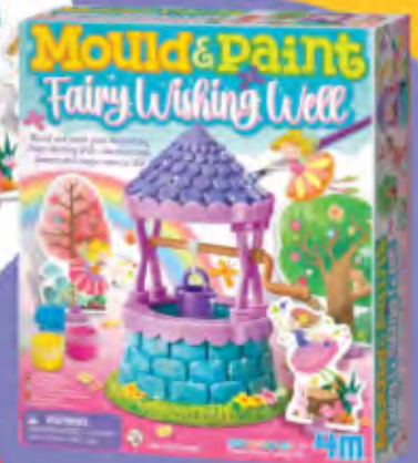
Mould & Paint Fairy Wishing Well 404792

www.greatgizmos.co.uk call us on 01293 543221 or email orders@greatgizmos.co.uk