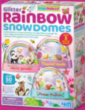
KidzMaker Glitter Rainbow Snowdomes 404795