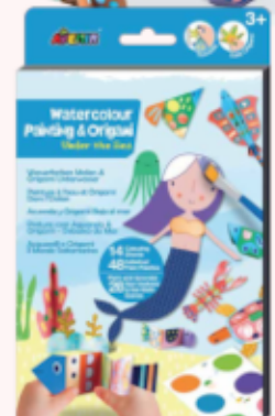
Under the Sea CH231882