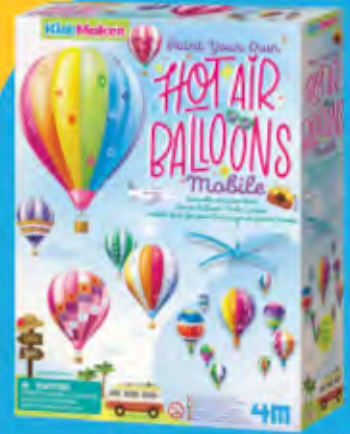
KidzMaker Hot Air Balloons Mobile 404791